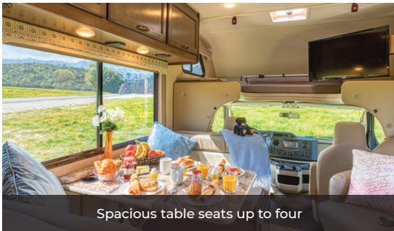
Spacious table seats up to four