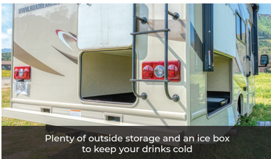
Plenty of outside storage and an ice box to keep your drinks cold