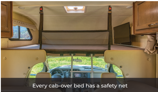
Every cab-over bed has a safety net